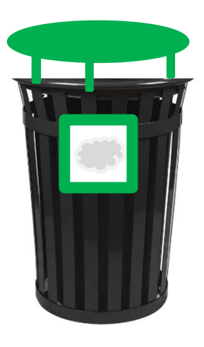
Look for the compost bins around campus